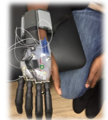
Driving, typing and a part-time job at JC Penney will be made a whole lot easier with the use of the Bionic I-Limb.