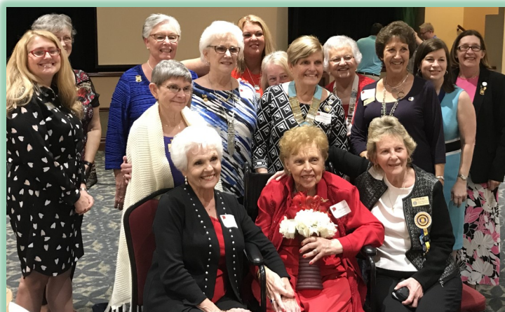
There's always time for a picture and the ladies of Dunedin North weren't going to miss the opportunity to gather with their special Inner Wheel guests. Five Inner Wheel clubs were represented in this group picture.

Sparkling stones of gratitude and appreciation are extended to the members of Dunedin North for their commitment to our Foundation motto, "Turning Possibilities into Realities."