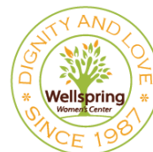
East Sacramento members prepare to stuff stockings for aging out foster youth at Sierra Forever Families. They also gather hygiene supplies and needed equipment for Well-spring Women's Center