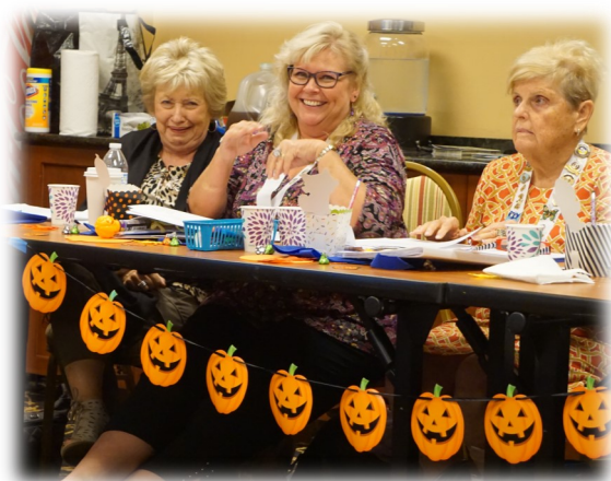
Above left: Winners in decorating contest in Greenville Governing Body meeting. Above right: A little work a lot of laughter as IWUSA gets things done.