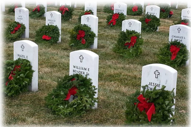
Slidell IW Club members placed Christmas wreaths at the Veterans Cemetery and support the Crisis Pregnancy Center with needed supplies.