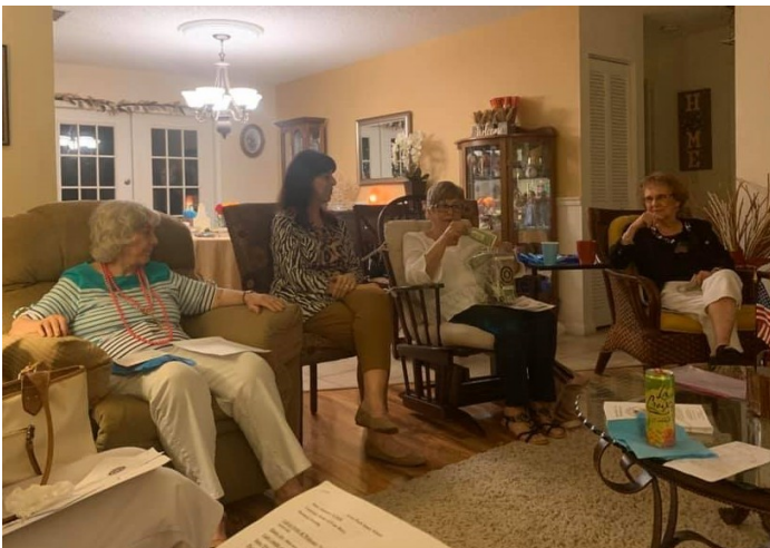
Above, Avon Park members confer at their January 16 meeting.

IW Avon Park members enjoyed all the festive décor of The Hotel Jacaranda just before Christmastime. The historic hotel in downtown Avon Park, built in the 1920s, is known for hosting its share of celebrities in its heyday including Babe Ruth, Clark Cable, and even Al Capone.