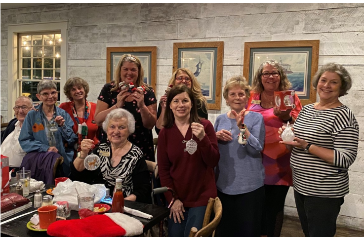
IW Dunedin North celebrated Christmas and IW friendship at its annual holiday dinner and ornament exchange on Dec. 19 at Sea Riders Restaurant in downtown Dunedin.

Dunedin North plans to host a silent auction as part of the Dunedin Rotary Club's Casino Night which was recently postponed to Aug. 28.