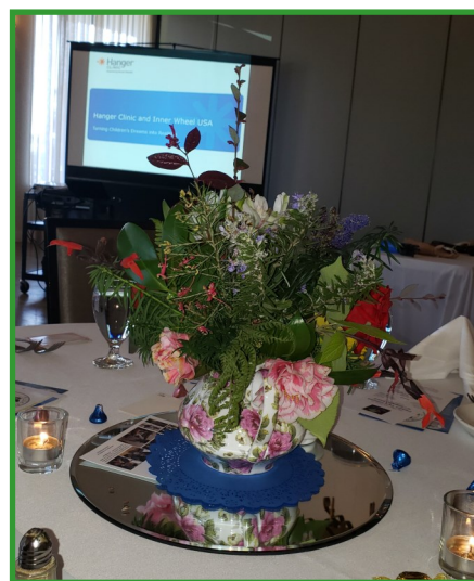
Lovely Fresh Flower Center Pieces in Tea Pots