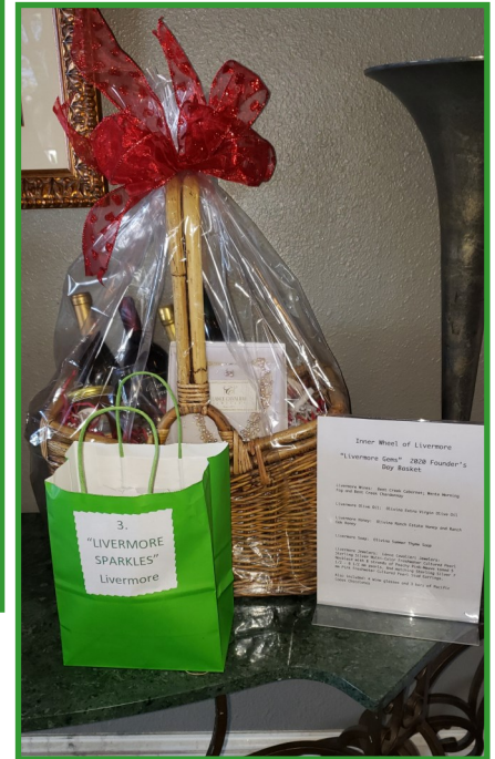
3. Livermore- "Livermore Sparkles"