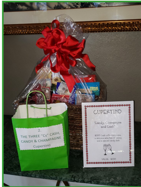
2. Cupertino- "Candy, Champagne & Cash"