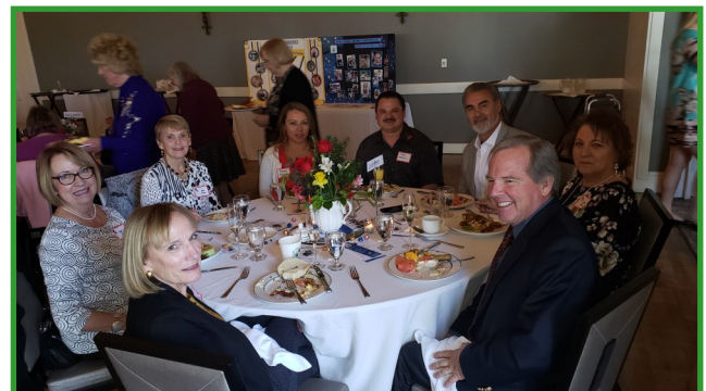
IW Club of Livermore Table