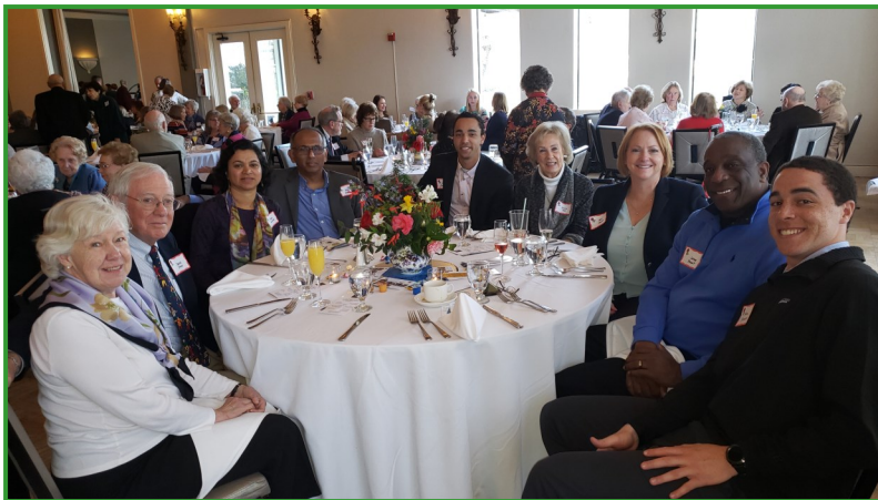
IW Club of Saratoga Table