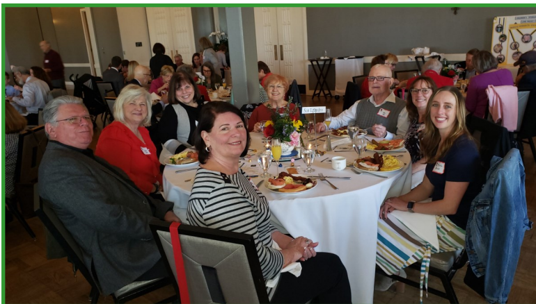
IW Club of San Leandro Table