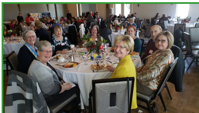
IW Executive Committee & President USA's Table