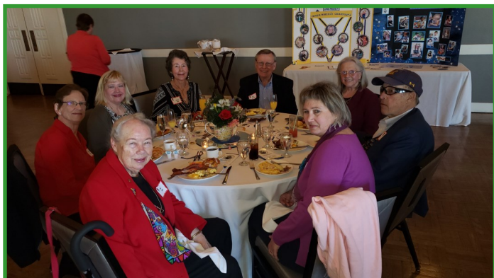
IW Club of San Leandro Table