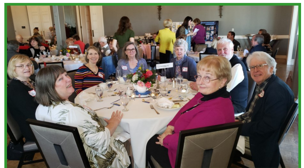
IW Club of Livermore Table