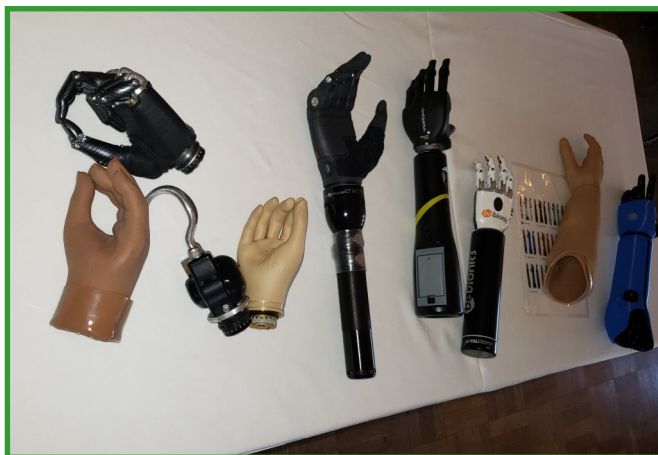
Prosthesis from Hanger Clinic