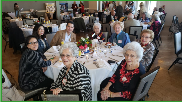
IW Niles-Fremont Club Table