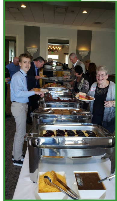
Brunch Buffet table at Castlewood Country Club