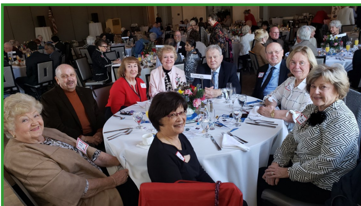
IW Club of Saratoga Table