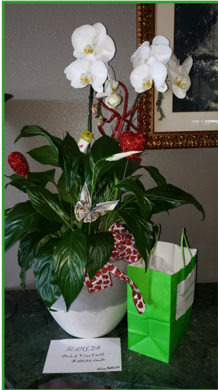
1. Alameda- "Spring Green"