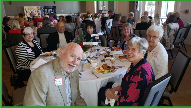
IW San Leandro Club & Alameda Club Table