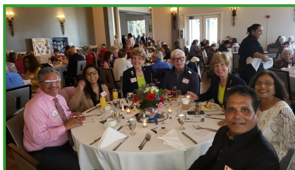
Table of Rotarians and their guests