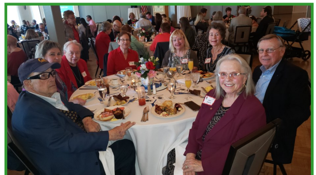
IW Club of San Leandro Table