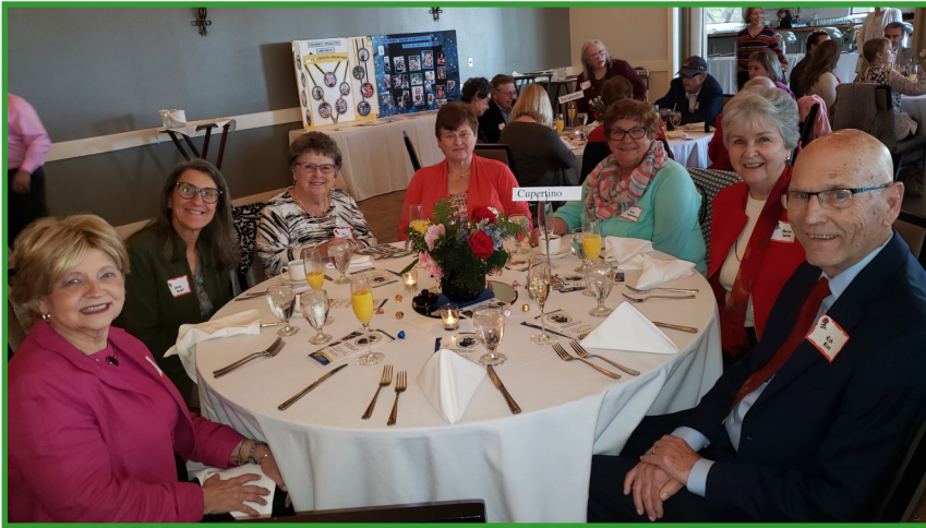
IW Club of Cupertino Table