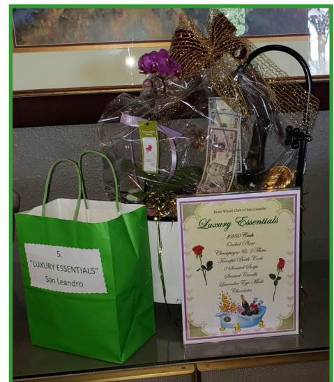
5. San Leandro- "Luxury Essentials"