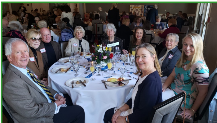
IW Club of Saratoga Table