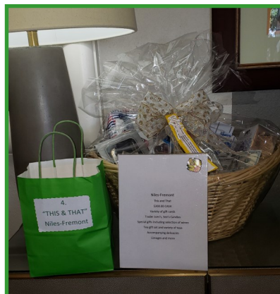
4. Niles-Fremont- "This and That"