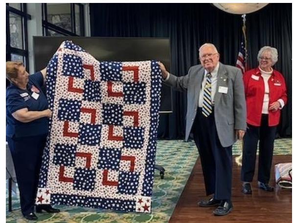
Military veterans display their "quilts of honor" at the Nov. 9 Inner Wheel District 519 meeting. The men served in World War II, Korea, Vietnam, Iraq, and Afghanistan.